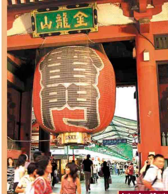
Asakusa Sensoji Temple